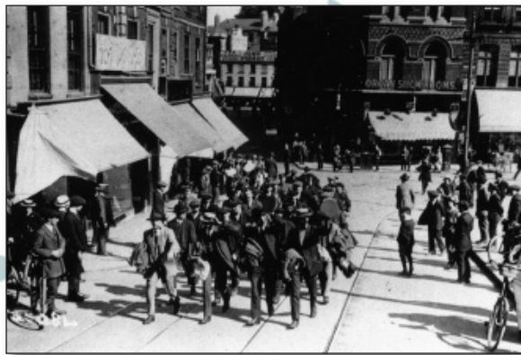
Kitchener Volunteers marching up Guildhall Hill, Norwich 1914.