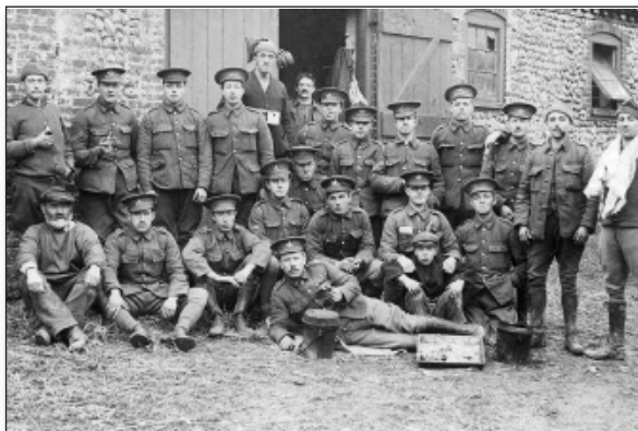
Above: Troops of the 111st Nottinghamshire Yeomanry beside their old barn billet in the countryside near Weybourne, November 1914.