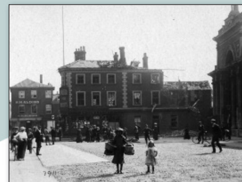
Left: The view across Dereham Market Place to the houses near the Corn Hall that received a direct hit and killed a soldier sheltering inside.