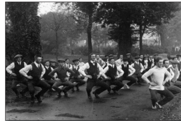
Physical Training for new recruits on Chapel Field Gardens, October 1914.