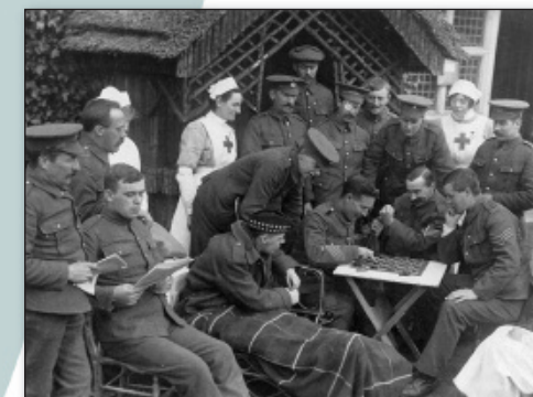
Above left: Nurses assisting on the stalls at the fete to raise money for the Soldier's Comfort Fund and their Auxiliary War Hospital in Harleston.